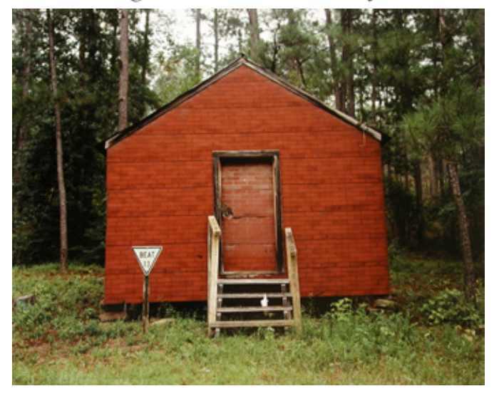
WILLIAM CHRISTENBERRY, RED BUILDING IN FOREST, HALE COUNTY, ALABAMA, 1994.

One of my first days in Washington, having just arrived from Tennessee, I wandered into the Smithsonian American Art Museum. I found myself surrounded by Kodak Brownie photographs of barns, country stores, Baptist churches, metal signs, family graveyards—striking reminders of the Southern landscape I'd left behind.