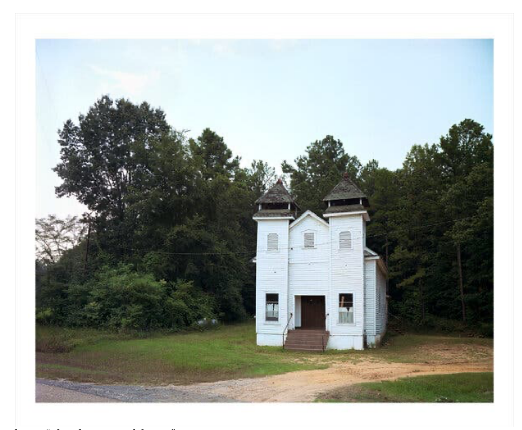
William Christenberry, "Church, Sprott, Alabama," 1981.